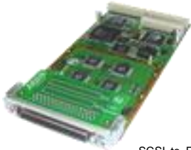
SCSI to Flying Lead Cable Provided