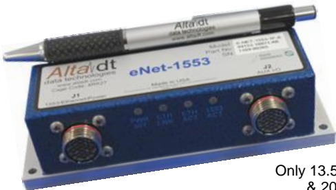
Only 13.5 x 3.7 x 4 cm & 200 grams Small, Rugged Appliance