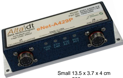
Small 13.5 x 3.7 x 4 cm 200 grams