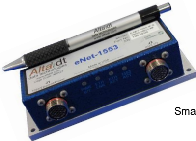
Small 13.5 x 3.7 x 4 cm 200 grams